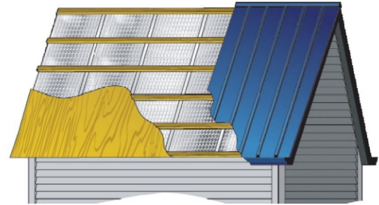
Inferno RB Insulation Application

Inferno RB insulation is single or double layer of polyethylene bubbles sandwiched between 2 reflective sheets. This type of insulation is ideal for commercial and residential applications, and is ideal for wall and ceiling insulation, crawl space, or any manufactured housing.